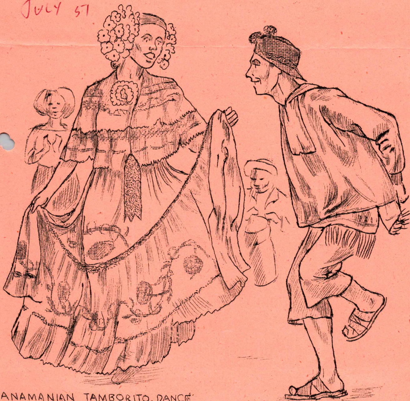
PANAMANIAN TAMBORITO DANCE