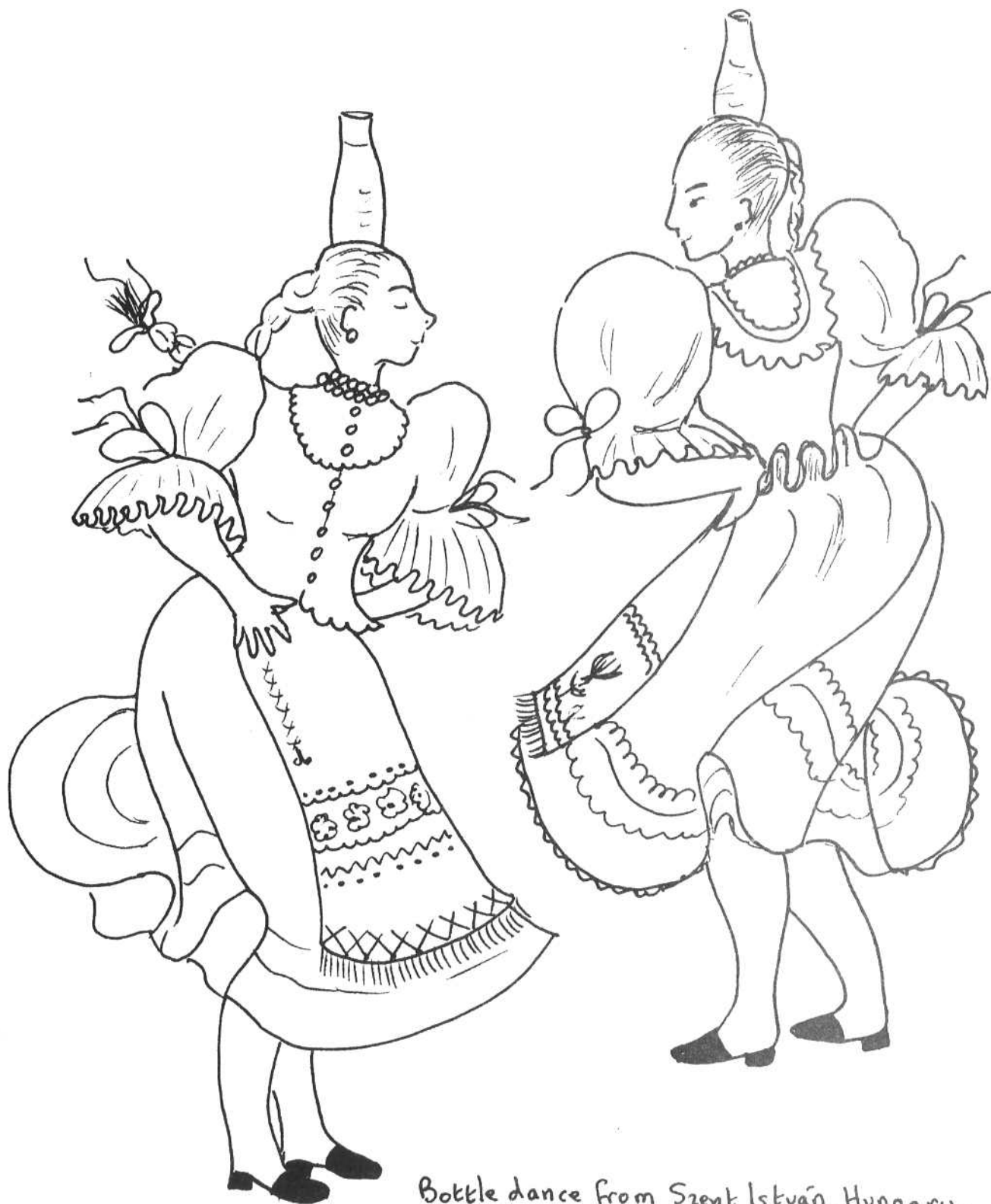
Bottle dance from Szent István, Hungary.