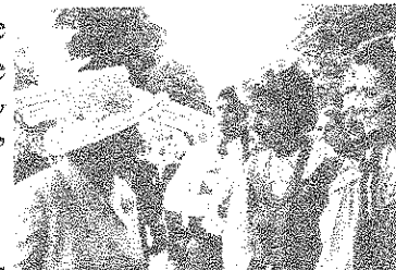
Meeting the Queen 2002