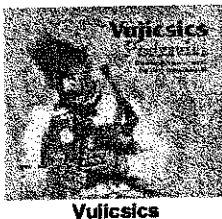
Vujicsics 'Podravina - Croatian Dance Melodies' (R-E-Disc 004) Price £12.00 Genre: Serbo-Croat