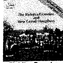
Bistritsa Grannies and Grand-Daughters 'Authentic Bulgarian Folk Songs' (GD 232) Price £10.00 Genre: Bulgarian