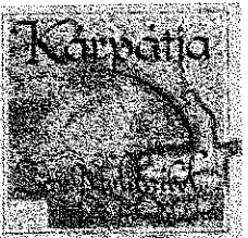
Karpathia 'Zene Moldvabol - Music from Moldavia' (ER-CD025) Price £12.00 Genre: Moldavian