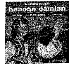
Benone Damian 'A Virtuoso of the Violin' (EDC224) Price £10.00 Genre: Romanian