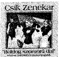
Csik Zenekar 'Happy Sad Song' (FA 011) Price £12.00 Genre: Hungarian