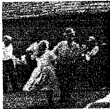
Various Artists 'Tanchaztalalkozo Dance House Festival' (MMICD-008) Price £12.00 Genre: Balkan