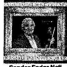
Sandor Fodor Neti 'Kalotaszegi Nepzene - Transylvanian Folk' (ABT 006) Price £12.00 Genre: Transylvanian