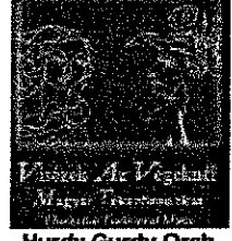
Hurdy-Gurdy Orch 'Hungarian Traditional Music' (BGCD 083) Price £12.00 Genre: Hungarian