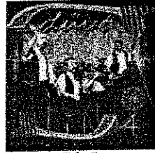
Duvó '4 - Hungarian Village Music' (BGCD 084) Price £12.00 Genre: Hungarian