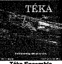
Téka Ensemble 'Erdélyország Sok Szép Vize' (TVM 106) Price £12.00 Genre: Hungarian

Above are just a small selection of the many folk and dance music CDs we offer. If you are have access to the Internet you can find our entire stock at the following web-sites: