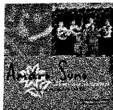
Amaro Suno 'Alom A Szememen' (FA 045-2) Price £12.00 Genre: Gypsy