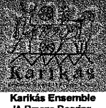
Karikás Ensemble 'A Breeze Bearing Sorrow' (BGCD 024) Price £12.00 Genre: Transylvanian