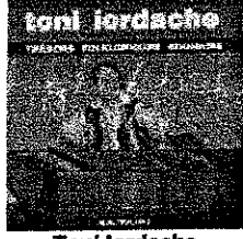
Toni Iordache 'Virtuoso of Cimbalom' (EDC164) Price £10.00 Genre: Romanian